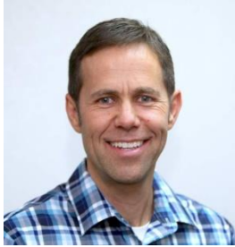
teacher at CHS.